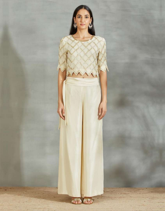
WHITE CROP TOP SET //