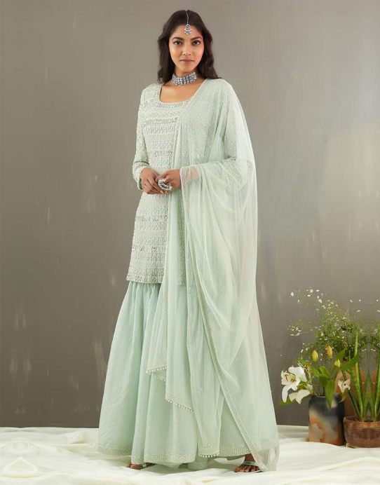
SEAFOAM GEORGETTE AND ORGANZA SHARARA AND KAMEEZ SET //