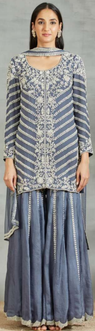
GREY SHARARA SET W/ PEARL WORK //