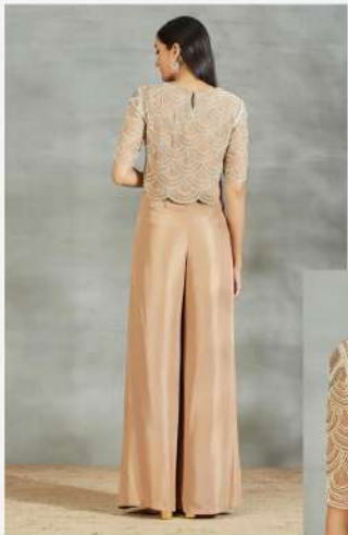
CHAMPAGNE CROP TOP SET W/ PEARL WORK //