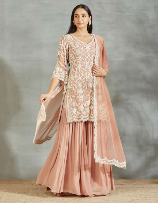
PINK SHARARA SET W/ PEARL WORK //