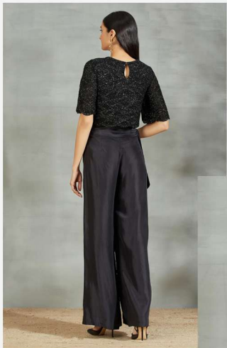
BLACK SEEP WORK CROP TOP SET I //