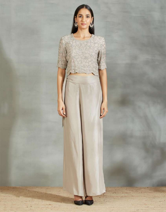
GREY CROP TOP SET //