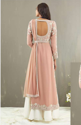
NUDE PINK GEORGETTE AND SILK JACKET WITH SKIRT SET //