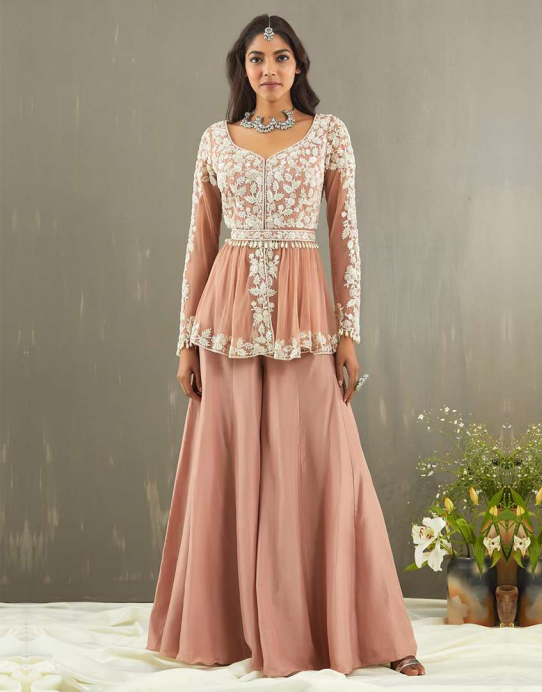
NUDE PINK NET AND SILK PEPLUM SHARARA SET //