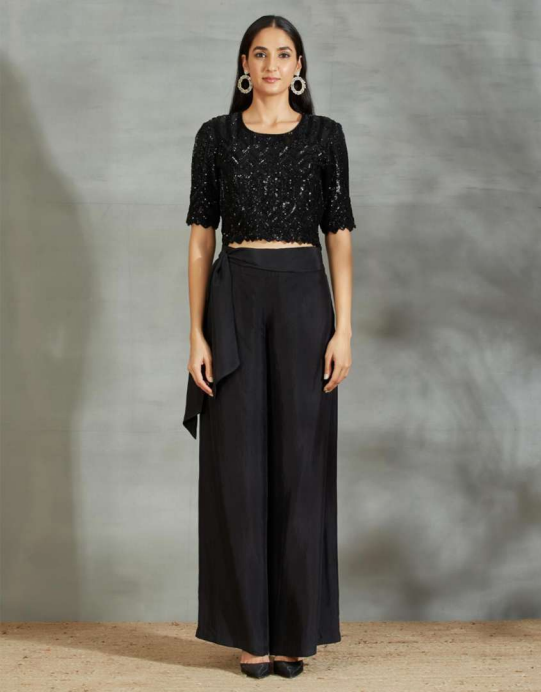
BLACK SEEP WORK CROP TOP SET II //