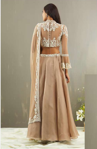
MOUSE NET, ORGANZA SKIRT AND BLOUSE SET //