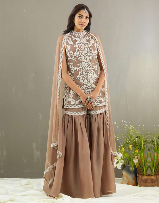
BROWN NET AND ORGANZA SHARARA AND KAMEEZ SET //