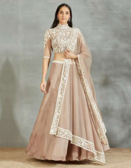
CHAMPAGNE BLOUSE AND LEHANGA SET //