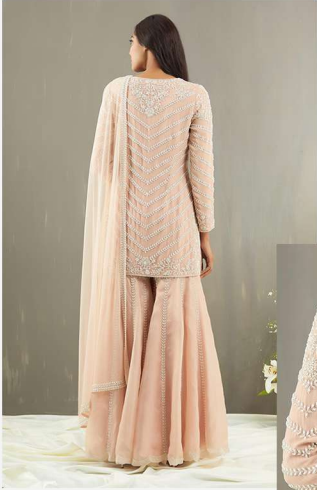
PEACH GEORGETTE AND ORGANZA SHARARA SET //