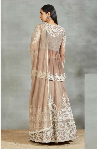
CHAMPAGNE PEPLUM LEHANGA SET //