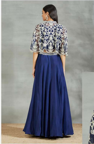
BLUE CAPE SKIRT SET W/ PEARL WORK //