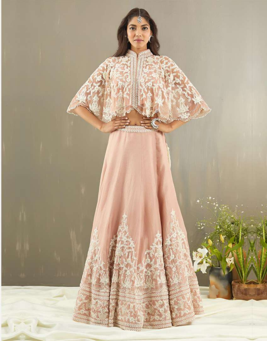
PINK NET AND ORGANZA CAPE W/ LEHENGA SET //