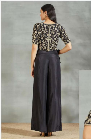
BLACK CROP TOP SET W/ PEARL WORK //