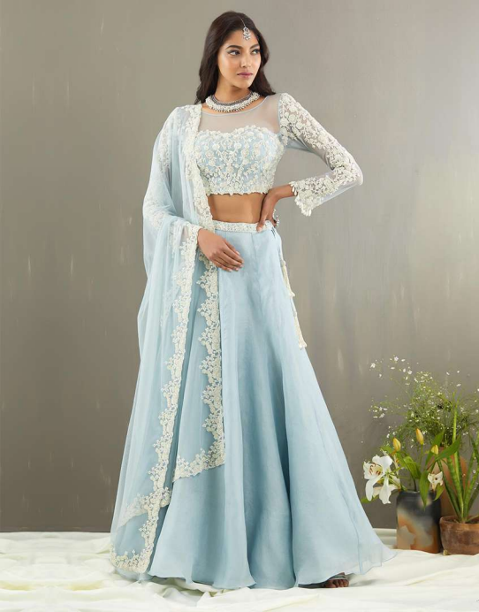
BLUE NET AND ORGANZA LEHENGA W/ BLOUSE SET //