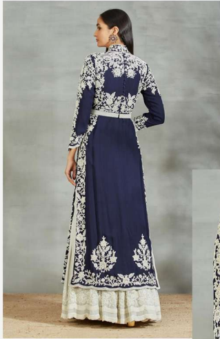
BLUE AND ICE BLUE JACKET LEHANGA SET WITH PEARL WORK //